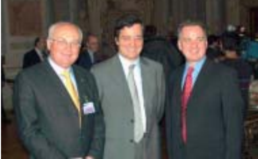
Present and previous REGLEG Presidents