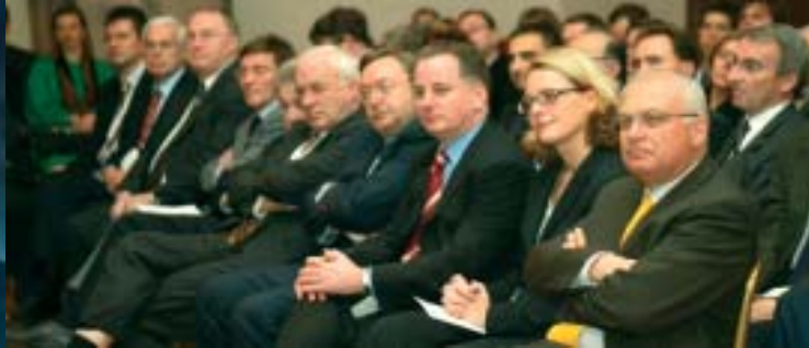
Annual conference – Salzburg November 2003