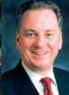
REGLEG President 2003-04