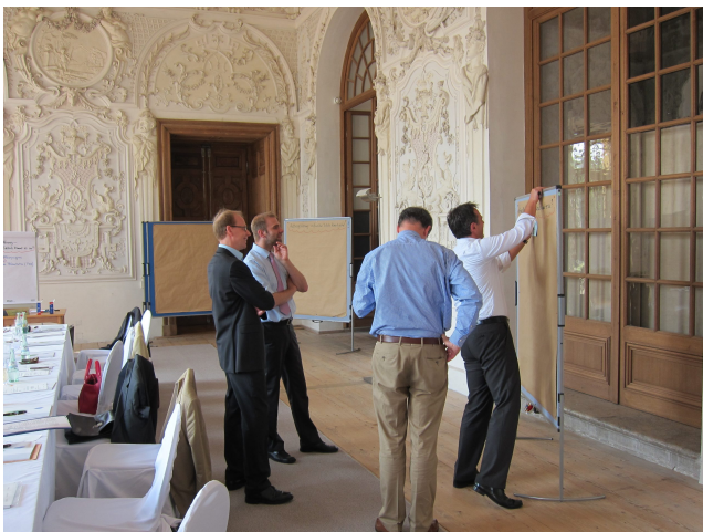
On the Pulse of Time — further education training series for top Bavarian civil servants in special functions.

Participants receive insights and inspiration on current matters concerning science, business, culture and society in a concise one-day seminar. Additionally, everyday aspects of the post associated with demanding top leadership positions are covered. This is a highly specialised target group. So, naturally, the seminar offers participants the chance to benefit from the experience of others and build informal contacts. Changing seminar venues offer fresh perspectives into cultural, scientific and a variety of other institutions.