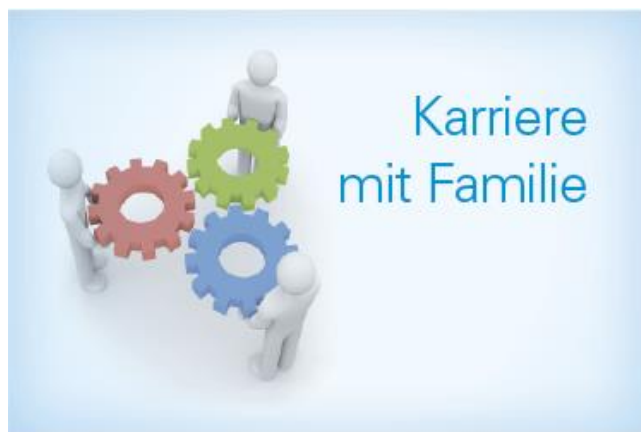
Logo Mentoring Programme

The Familienpakt Bayern (Bavarian Family Agreement), from the Bavarian State Government signalises the improvements to come in balancing work and family life. Its aim is to adapt the world of work to changing life and family models. The „Career and Family“ mentoring programme is designed to help participants build the goals from Familienpakt into their own professional lives. This should be in keeping with the modern age, tangible and effective.