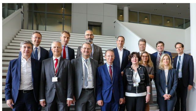
Group of heads of Human Resources at Infineon Technologies AG.

The Introductions Programme Building Bridges is aimed at heads of human resources departments. At informal meetings, top civil servants can exchange ideas with human resource managers from non-governmental organisations and leading corporations. At the same time, these meetings also provide an opportunity for casual discussions with colleagues from other governmental areas. The agenda comprises current topics that include employee mobility, diversity and inclusion, Social Media, recruiting young talent, Human Resource developments and health management. The aim of the programme is to make new contacts and strengthen existing ones —or in other words — to Build Bridges .