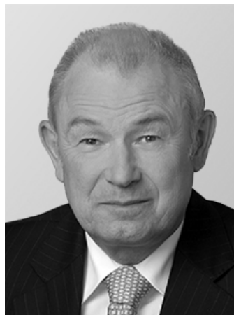
Dr. Günther Beckstein