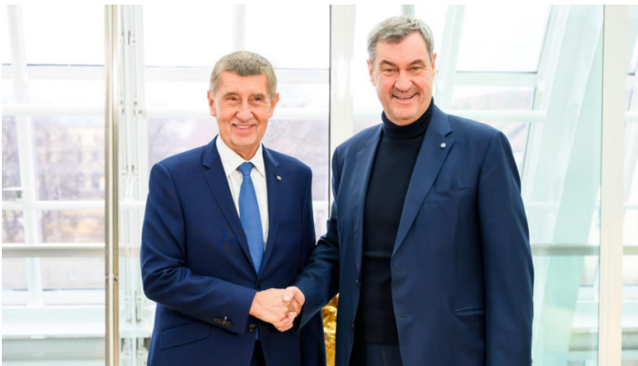
On 9 February 2026, Minister-President Dr Markus Söder welcomed the Prime Minister of the Czech Republic, Andrej Babiš, to the Bavarian State Chancellery for talks.