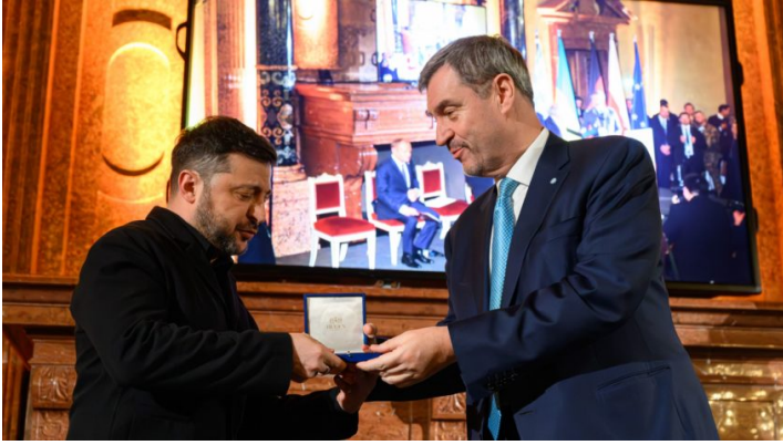
On 14 February 2026, Ukrainian President Volodymyr Zelenskyy accepted the Ewald von Kleist Prize from Prime Minister Dr Markus Söder on behalf of the Ukrainian people.