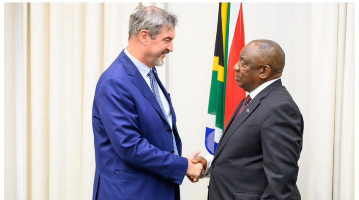
Minister-President Dr Markus Söder (left) meets with the President of the Republic of South Africa, Cyril Ramaphosa (right), for talks in Cape Town on 4 November 2025.