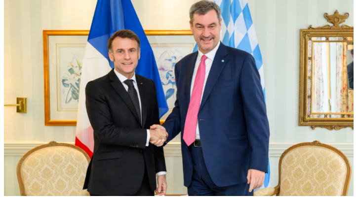
On 13 February 2026, Minister President Dr Markus Söder met with the President of the French Republic, Emmanuel Macron, at the 62nd Munich Security Conference.