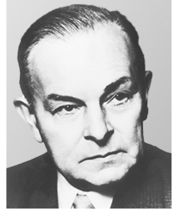
Dr. h. c. Max Streibl