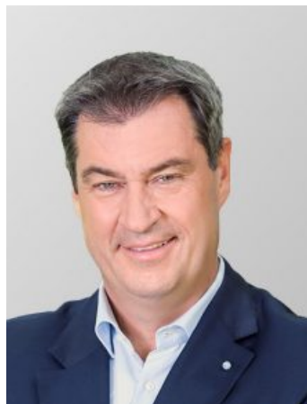
Dr. Markus Söder, MdL