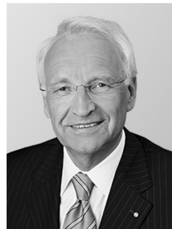
Dr. Edmund Stoiber